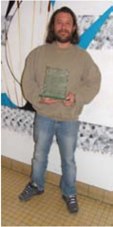
Steve Wilson Graffiti Art Award

Did you know that the Graffiti Art's programs encourages at-risk youth, often in trouble with the law to express their talents in constructive rather than destructive ways? Graffiti Art offers free after school activities, provide mentors and support workers to youth. The Graffiti Art's program develops murals in the South Point Douglas and other areas.